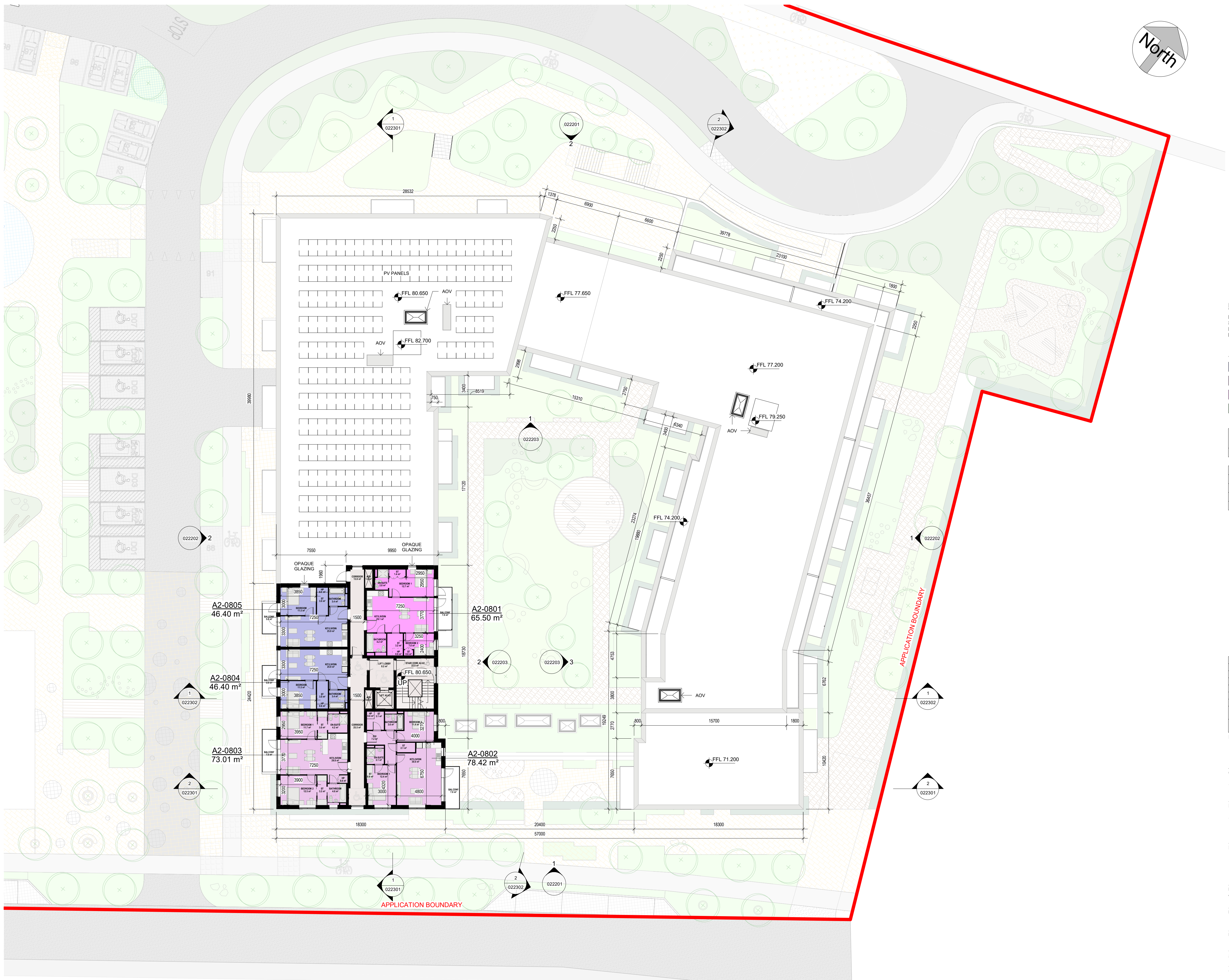
1 BLOCK A -L08-EIGHTH FLOOR PLAN